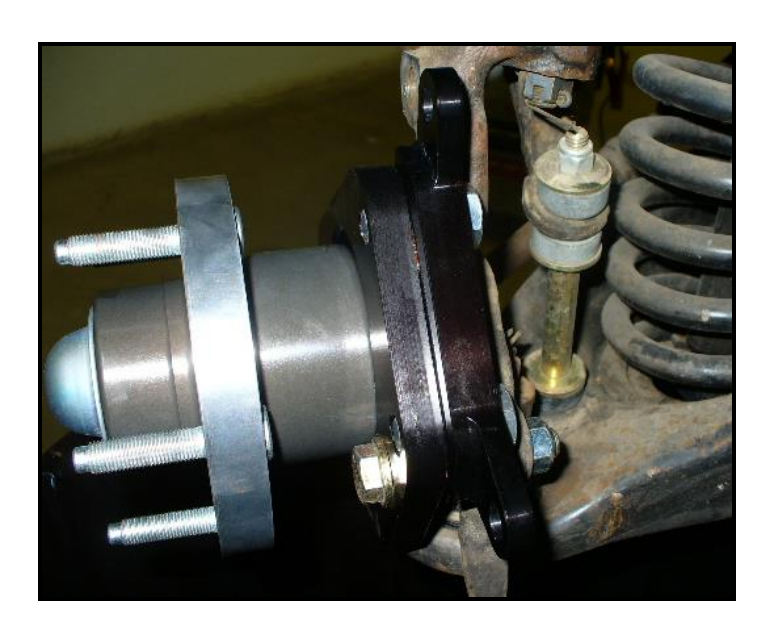
Intermediate bracket installed Part number engraved on bracket faces outward

5. Install the new hub. The new bearings are pre-packed with synthetic grease. Do not add more grease. Apply a small amount of grease to the hub seal surface and install the hub. Tighten the nut to 5-10 ft·lbs and spin the hub to seat the bearings. Loosen and re-tighten the nut while spinning the hub several times. Loosen the nut, tighten to remove all play, tighten approximately 1/16<sup>th</sup> turn or more to align cotter pin holes, to give a small amount of pre-load. Install nut retainer, cotter pin and dust cap.