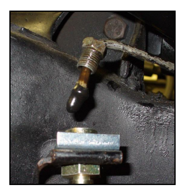
Hose lock location and vinyl cap installed

1. Disconnect the brake hose from the hardline at the frame using a line wrench. Cap the hardline with the supplied vinyl cap to avoid brake fluid dripping. See photo below for reference: