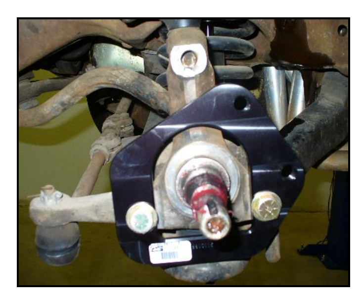
Left bracket installed, caliper to rear of spindle pin

5. Install the new hub. The new bearings are pre-packed with synthetic grease. Do not add more grease. Apply a small amount of grease to the hub seal surface and install the hub. Tighten the nut to 5-10 ft·lbs and spin the hub to seat the bearings. Loosen and re-tighten the nut while spinning the hub several times. Loosen the nut, tighten to remove all play, tighten approximately 1/16<sup>th</sup> turn or more to align cotter pin holes, to give a small amount of pre-load. Install nut retainer, cotter pin and dust cap.